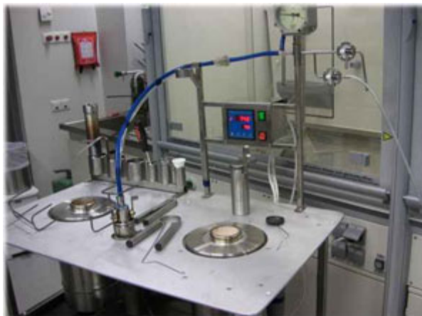
New lab (Low T set)

Reaction vessel is the Heart of benzene line. Reaction vessel is included in the high temperature module. It serves to synthesize lithium carbide by performing of chemical transformation reactions using Carbon of any kind of carbon containing sample material and lithium metal. It is covered with hermetic vacuumed and water cooled head and it works at 750-850^{\circ}C as it was described at Skripkin, 1998.